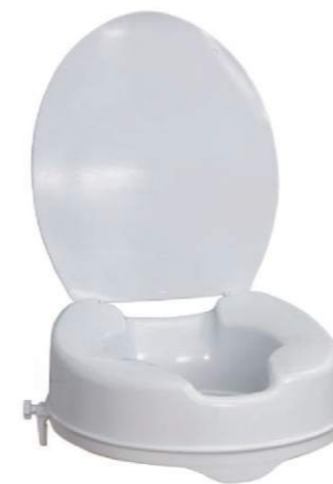
➤ BT430: Raised toilet seat with cover