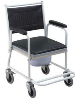
BT1011: Steel commode chair