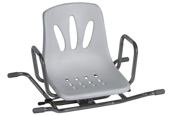
➤ BT410: Stainless steel swivel Shower chair