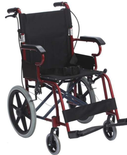
➤ BT941: Aluminum light weight wheelchair