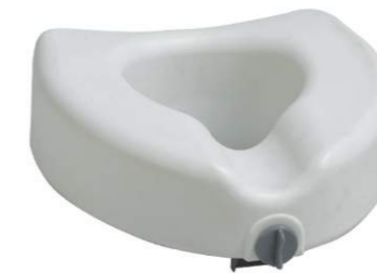
➤ BT429: Raised toilet seat without cover