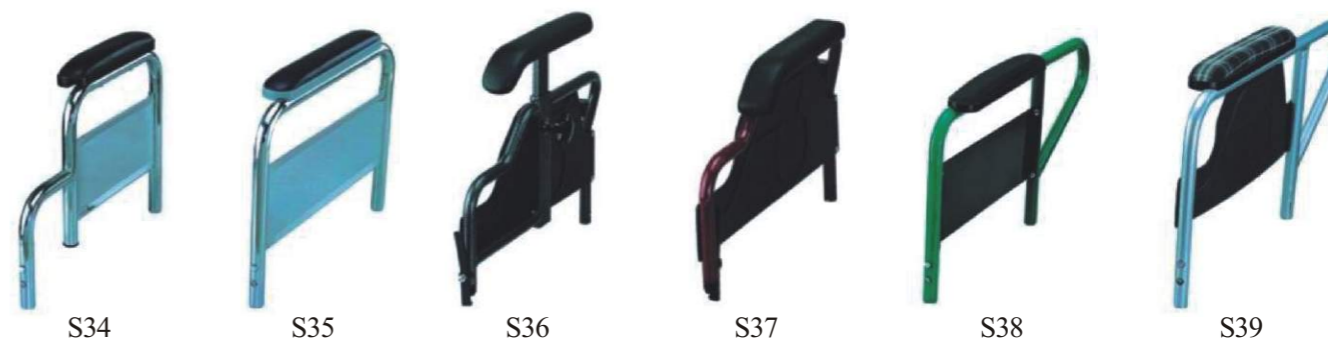
S34 S35 S36 S37 S38 S39