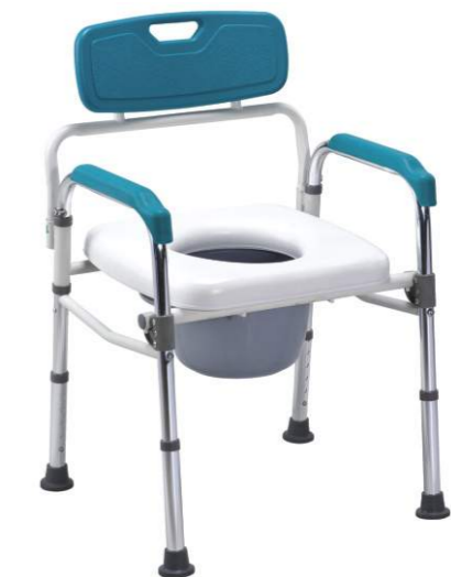
➤ BT1016: Aluminum commode chair