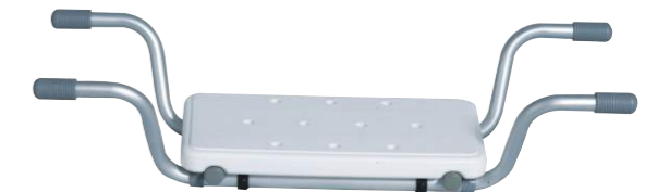
➤ BT425: Aluminum bath seat