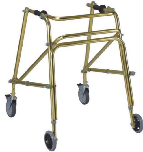
▶ BT526: Steel walker