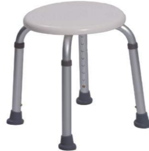
➤ BT419: Aluminum Bath Stool