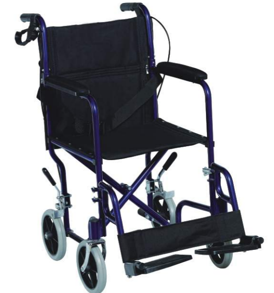
➤ BT942: Aluminum light weight wheelchair