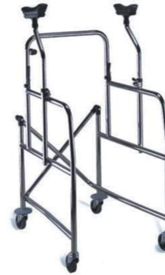
▶ BT583: Steel walker