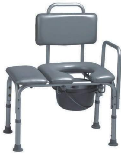
➤ BT408: Aluminum shower & commode chair