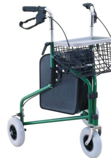
➤ BT853: Steel tricycle rollator