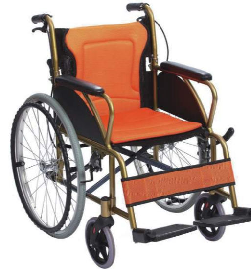
➤ BT911: Aluminum wheelchair