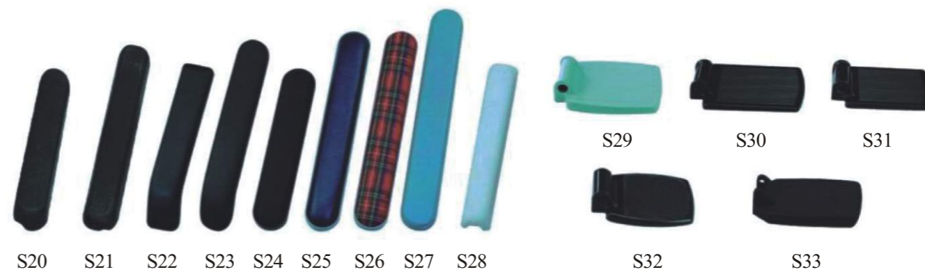
S20 S21 S22 S23 S24 S25 S26 S27 S28 S29 S30 S31 S32 S33