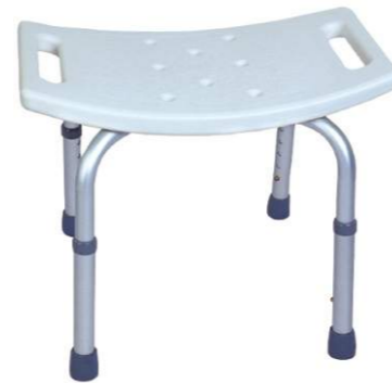
➤ BT418: Aluminum Shower Chair