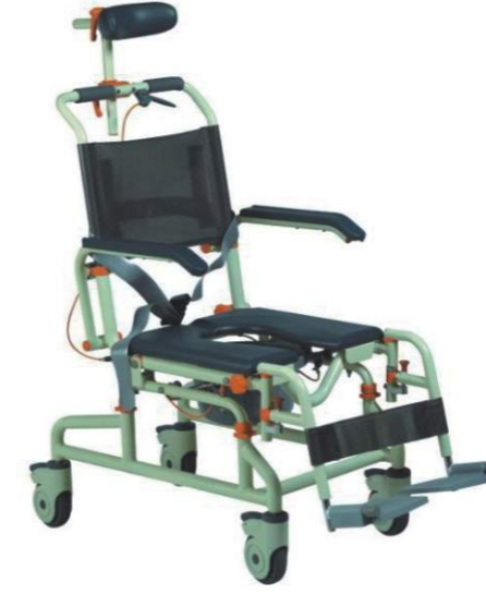
➤ BT1001: Aluminum shower chair with commode