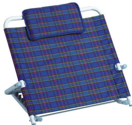
▶ BT535: Steel Backrest