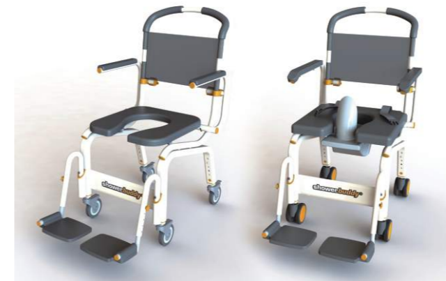
➤ BT1003: Roll-in shower chair series