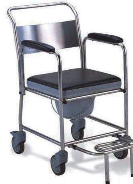
➤ BT1010: Stainless steel commode and shower chair