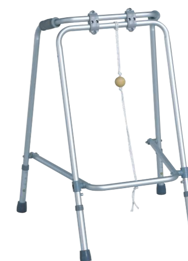
BT521: Aluminum walker