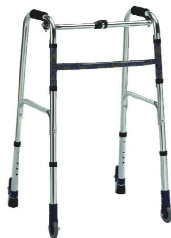
BT517: Aluminum walker