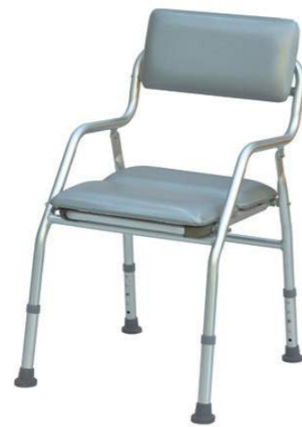
➤ BT427: Aluminum shower chair