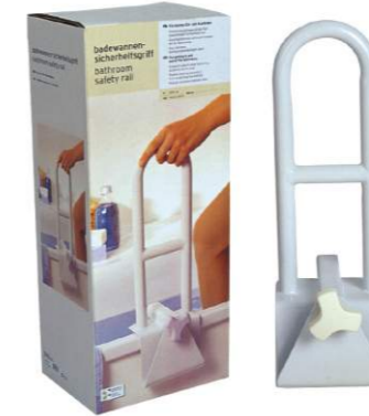
➤ BT415: Steel Bathtub Bar