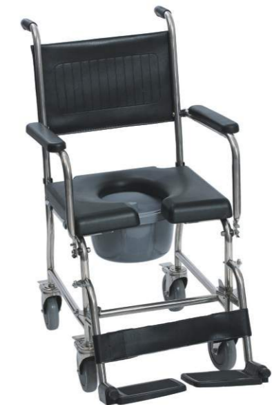
➤ BT1008-2: Stainless steel commode and shower chair