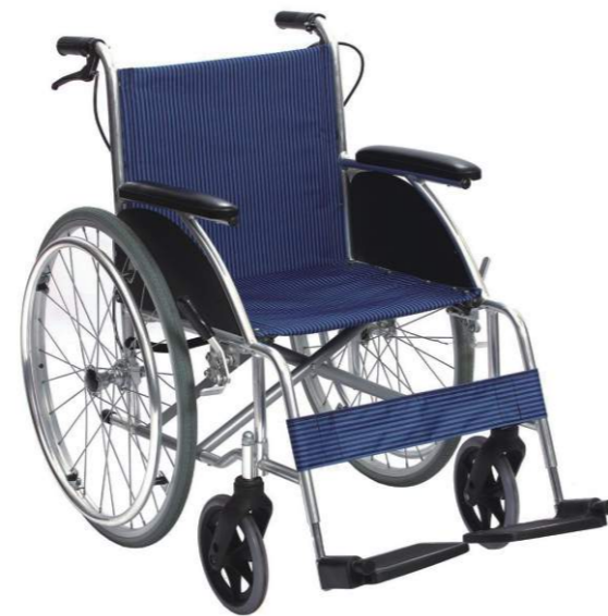
➤ BT919: Aluminum wheelchair