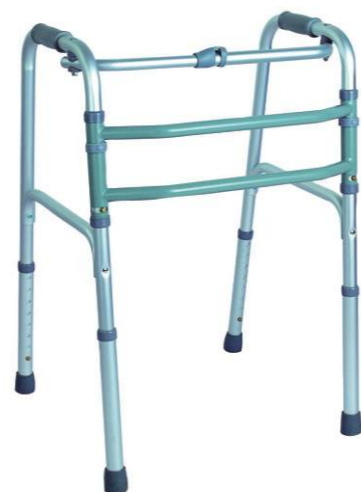
BT515: Aluminum walker