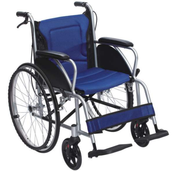
➤ BT912: Aluminum wheelchair