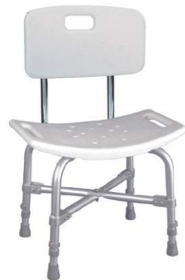
➤ BT421: Heavy duty aluminum bath seat