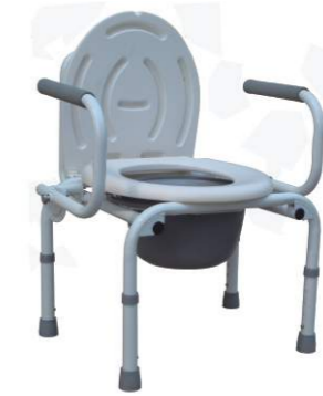
BT1054: Steel commode chair