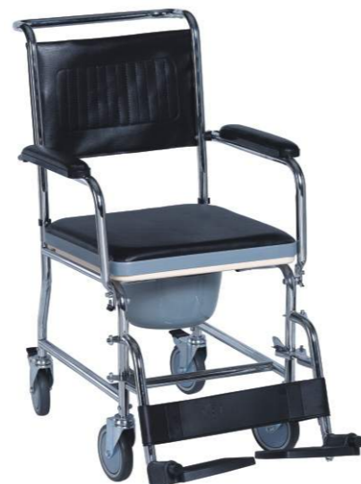
➤ BT1007: Steel commode chair