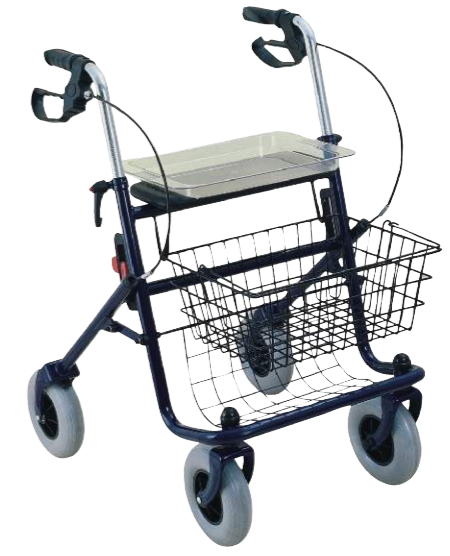
➤ BT851: Four-wheel steel rollator