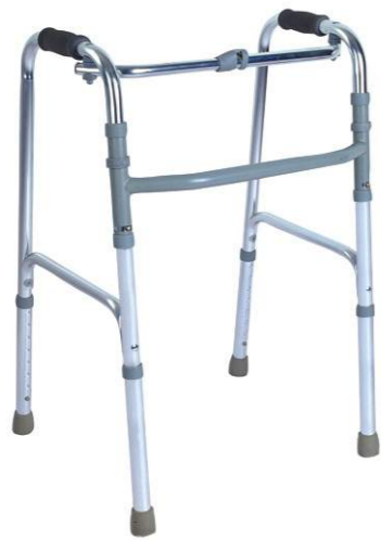
▶ BT507: Aluminum walker