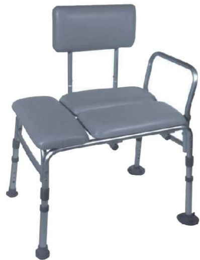
➤ BT407: Aluminum shower chair