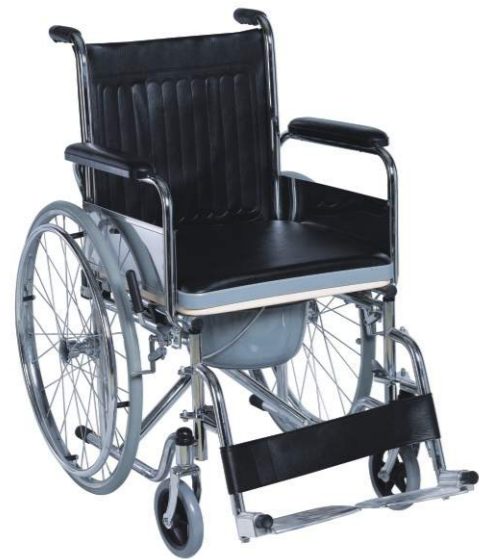
➤ BT1004: Steel commode wheelchair