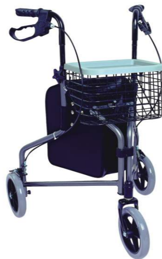
➤ BT855: Aluminum tricycle rollator