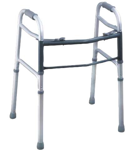
▶ BT513: Aluminum walker