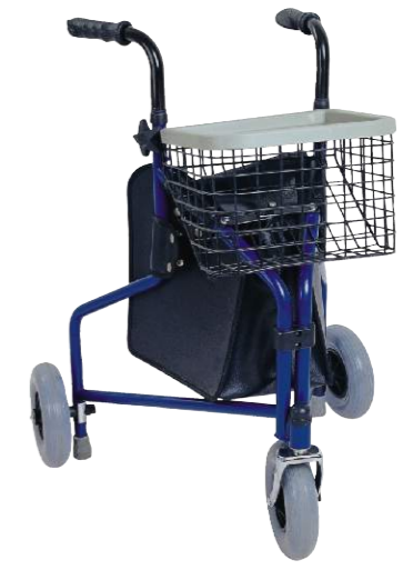
➤ BT854: Delta rollator