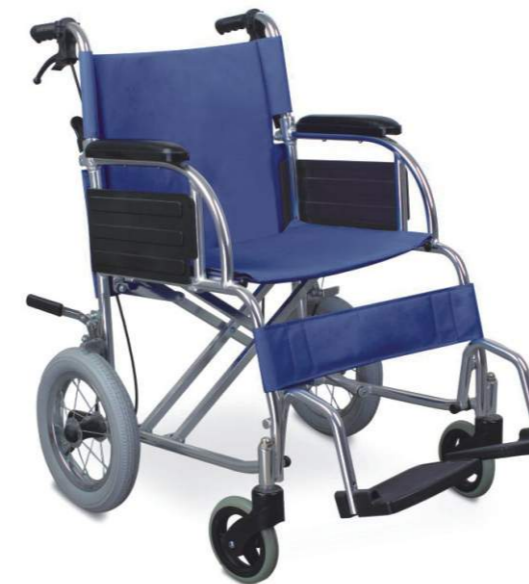
➤ BT945: Aluminum transport wheelchair