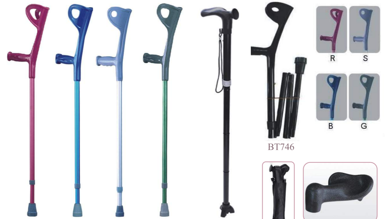
BT742 BT743 BT744 BT745 BT756