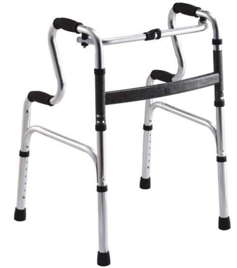
▶ BT510: Aluminum walker