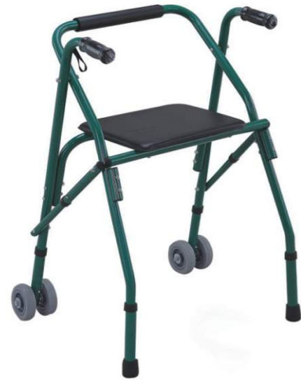
▶ BT524: Aluminum walker