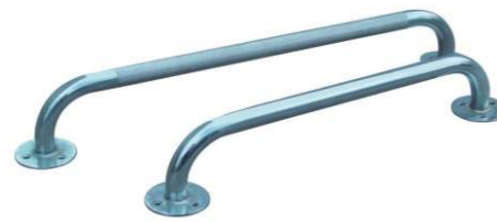
➤ BT435: Chrome Steel Bathtub Bar