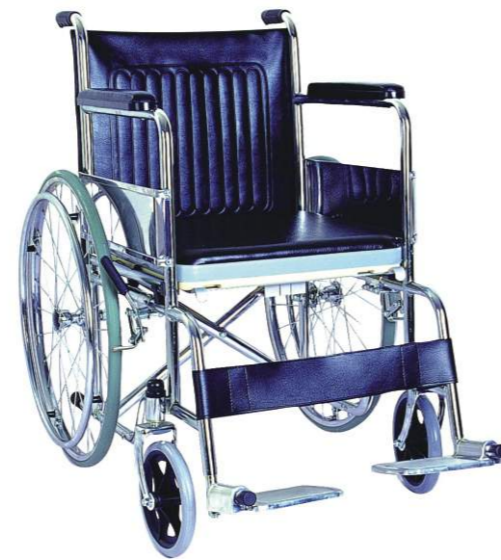
➤ BT1005: Steel commode wheelchair