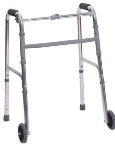
▶ BT508: Aluminum walker