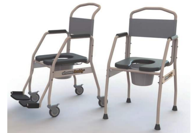
➤ BT1008: Aluminum shower chair with commode