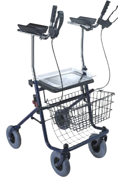
➤ BT850: Steel forearm rollator