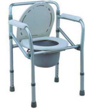
BT1052: Aluminum commode chair