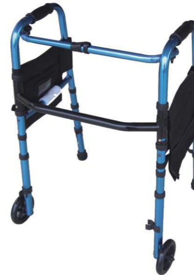
➤ BT503: Non-reciprocating aluminum walker