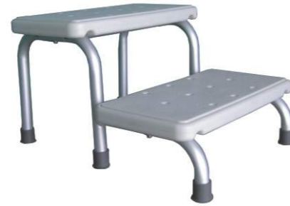
➤ BT426-2: Aluminum Bathtub Step