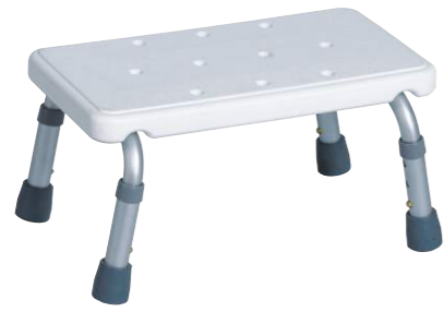
➤ BT426-1: Aluminum Bathtub Step