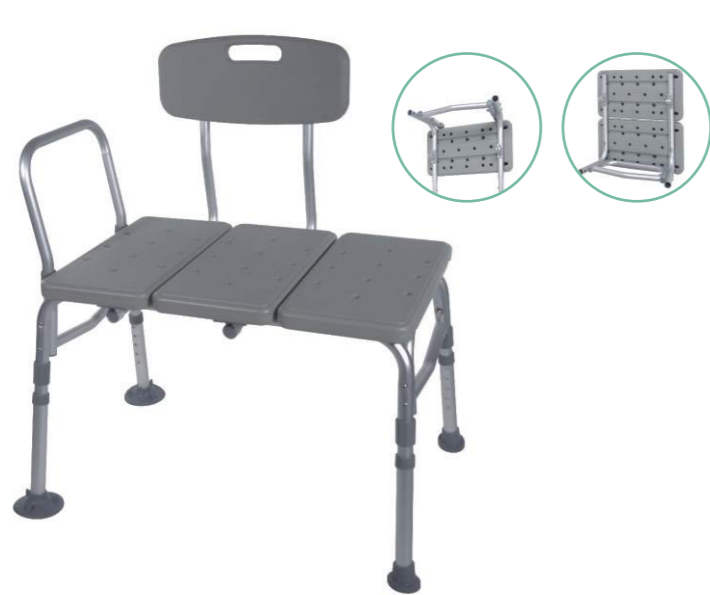
➤ BT405: Aluminum shower bench