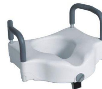
➤ BT428: Raised toilet seat with armrest