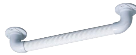
➤ BT438: ABS Bathroom Suction Grip Bar

Bathroom suction grip bar ABS Plastic material