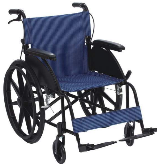
➤ BT918: Aluminum wheelchair