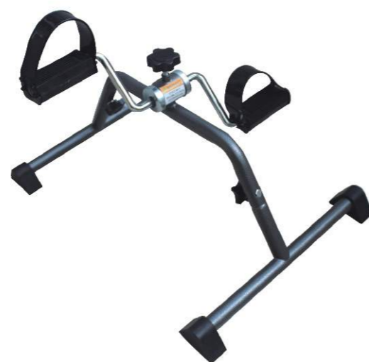
▶ BT540: Pedal exerciser