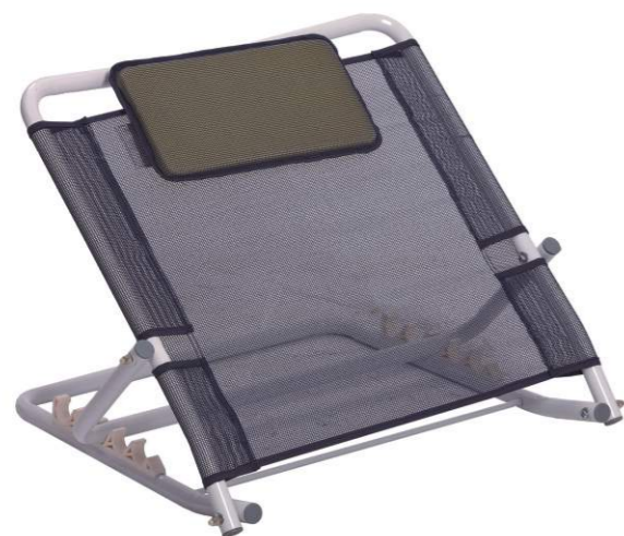
▶ BT536: Steel Backrest