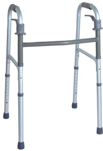
▶ BT505: Aluminum Walker