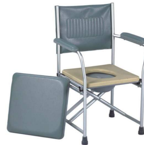
➤ BT1013: Aluminum commode chair