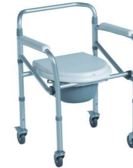
BT1053: Aluminum commode chair