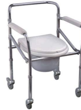
BT1051: Steel commode chair