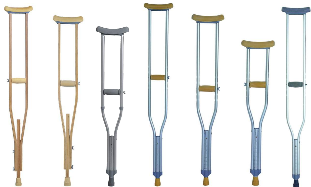
BT704 BT705 BT706 BT707 BT708 BT709 BT710