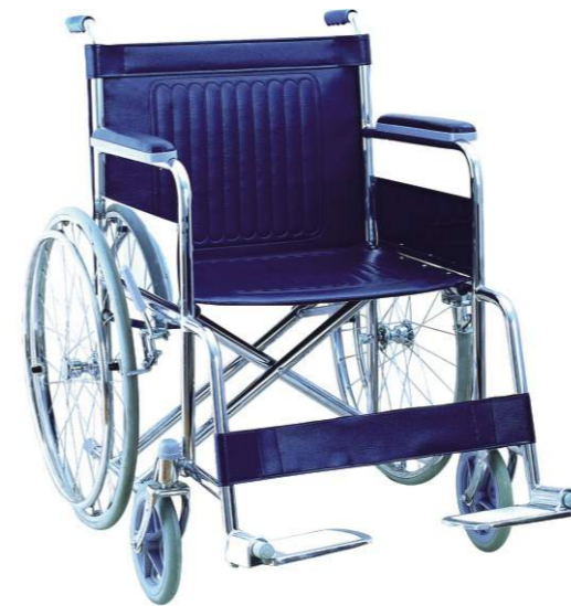
BT976: Heavy duty steel wheelchair