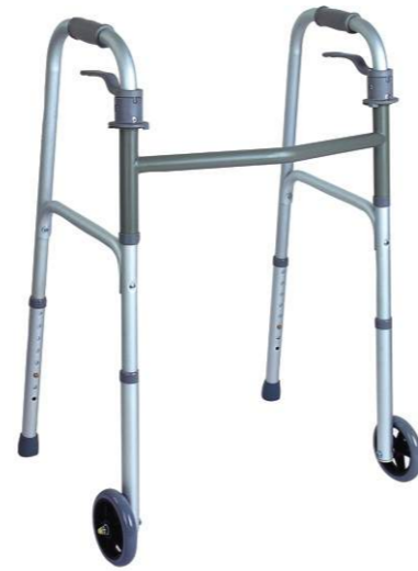
▶ BT506: Aluminum walker