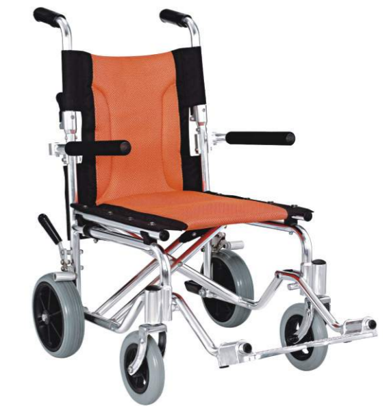
➤ BT946: Aluminum light weight wheelchair