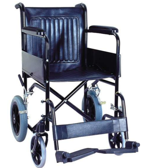
BT971: Steel Wheelchair