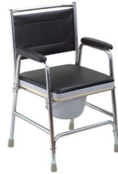
BT1012: Steel commode chair