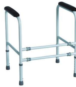
➤ BT437: Toilet Safety Frame