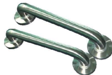
➤ BT435S: Stainless Steel Bathtub Bar