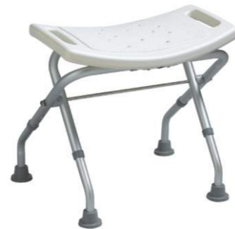
➤ BT422: Aluminum Foldable shower chair