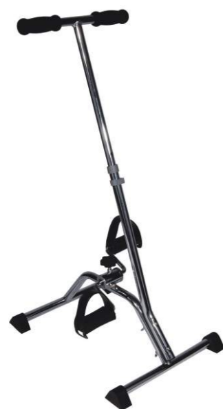
▶ BT539: Pedal exerciser