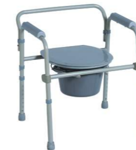
BT1055: Steel commode chair