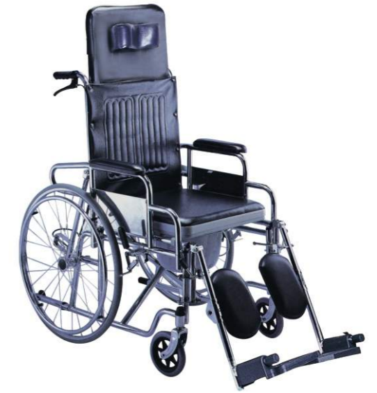
➤ BT1002: Steel reclining commode wheelchair