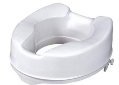
➤ BT431: Raised toilet seat without cover