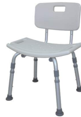
➤ BT409: Aluminum Shower chair