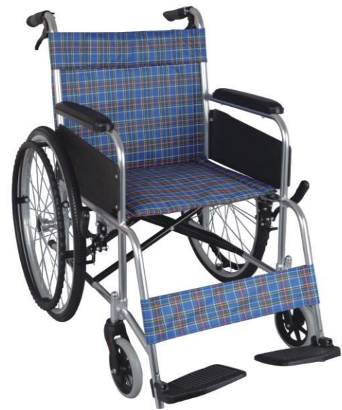
➤ BT915: Aluminum wheelchair