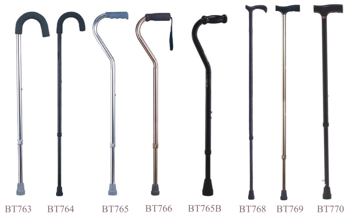
BT763 BT764 BT765 BT766 BT765B BT768 BT769 BT770