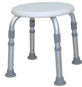
➤ BT420: Aluminum Bath Stool