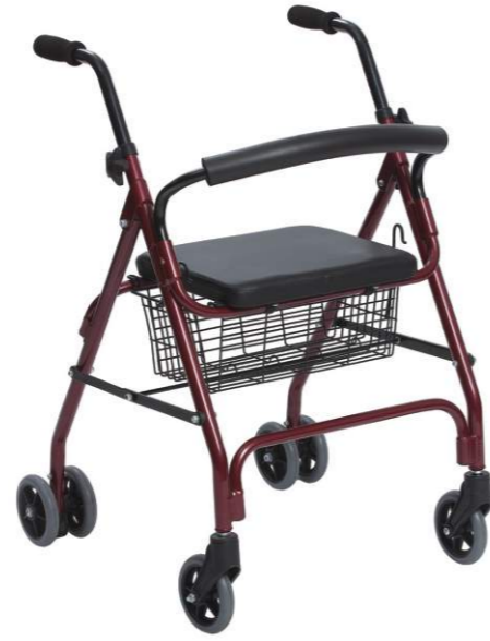
➤ BT819: Aluminum rollator