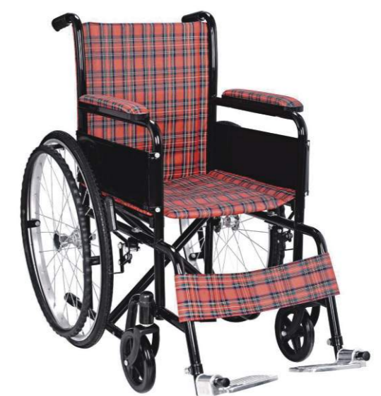
BT973-35: Children wheelchair