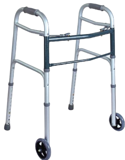
BT514: Aluminum walker