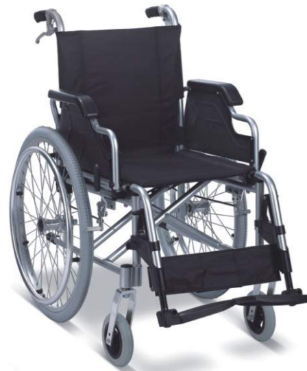
➤ BT903: Aluminum wheelchair