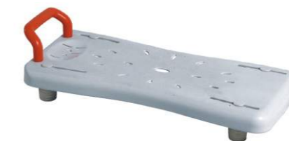
➤ BT414: Shower board Width adjustable