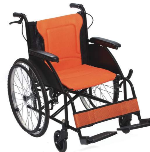
➤ BT913: Aluminum wheelchair