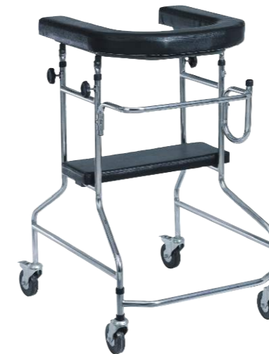
▶ BT580: Steel walker Foldable