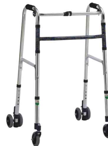
BT518: Aluminum walker