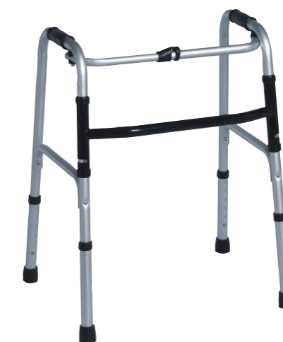
BT519: Aluminum walker