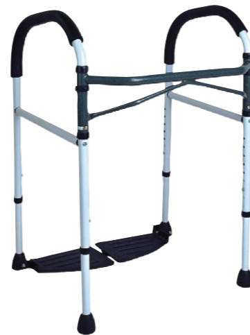
▶ BT537: Toilet Aid