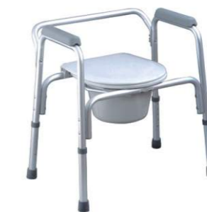
BT1056: 3 In 1 Aluminum Commode chair