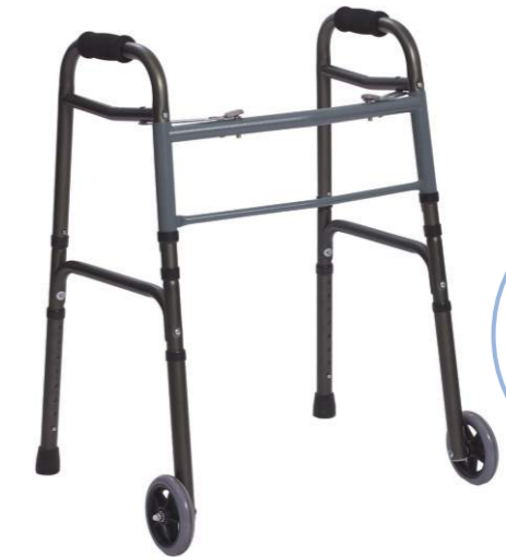
➤ BT502: Aluminum walker