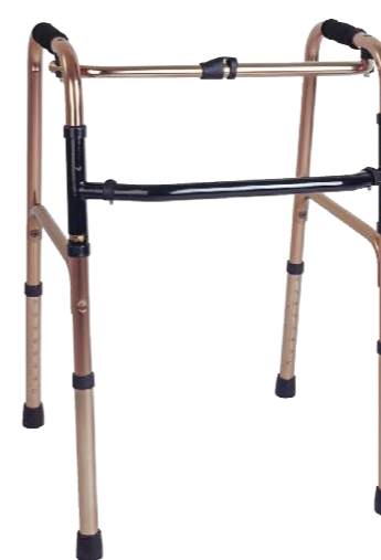
BT520: Aluminum walker