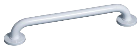
➤ BT417: Bathroom suction grip bar

Bathroom suction grip bar ABS Plastic material