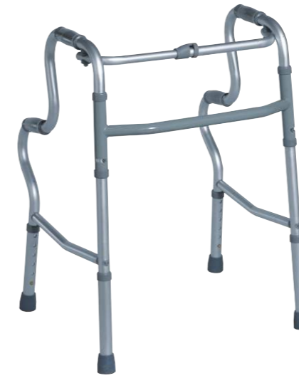
▶ BT509: Aluminum walker