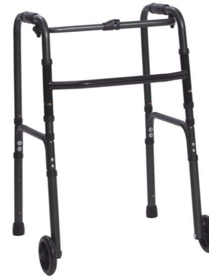
➤ BT501: Aluminum walker