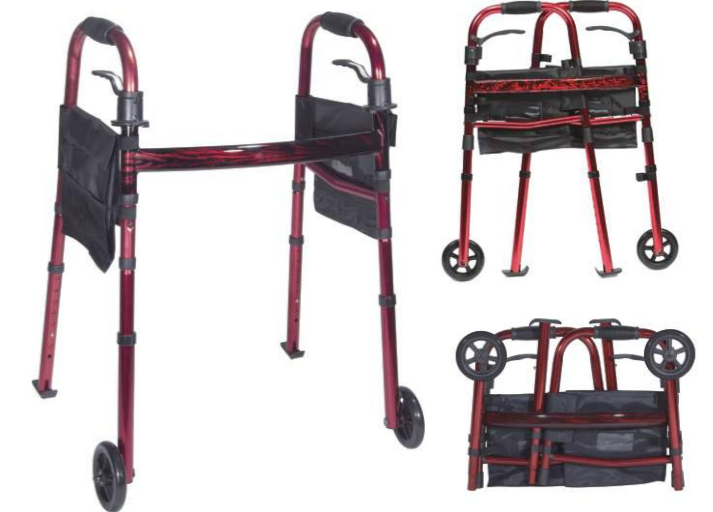
➤ BT504: Aluminum walker