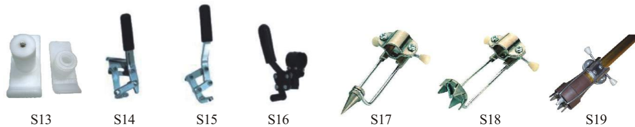
S13 S14 S15 S16 S17 S18 S19