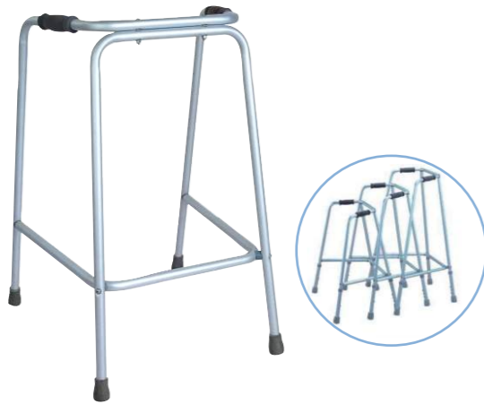
▶ BT532: Aluminum walker