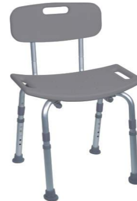
➤ BT411: Aluminum shower chair