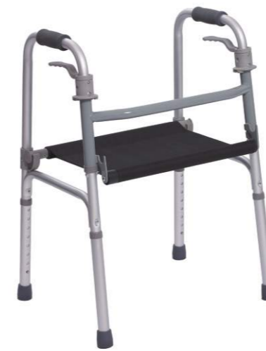
▶ BT512: Aluminum walker