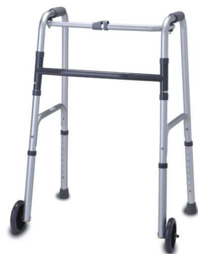
BT516: Aluminum walker