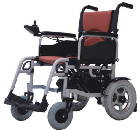
➤ BT6021: Electric Wheelchair