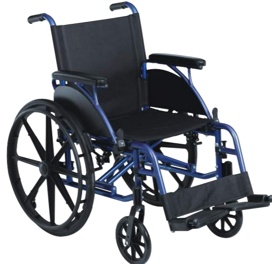
➤ BT904: Aluminum wheelchair