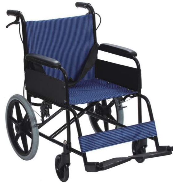
➤ BT916: Aluminum light weight wheelchair