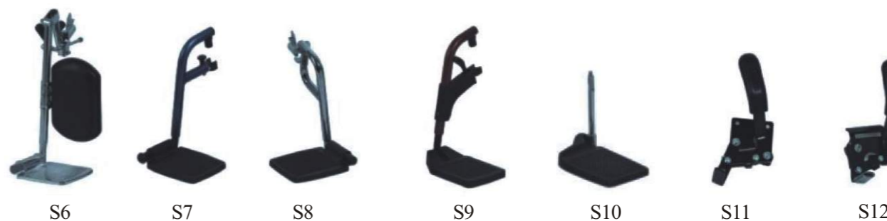
S6 S7 S8 S9 S10 S11 S12