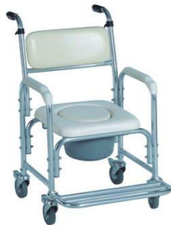
BT1019: Aluminum commode chair