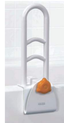
➤ BT416: Steel Bathtub Bar