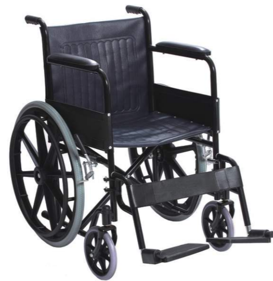
BT964: Steel wheelchair