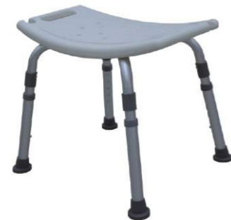
➤ BT423: Aluminum knock Down style bath chair