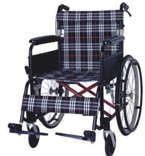
➤ BT914: Aluminum wheelchair