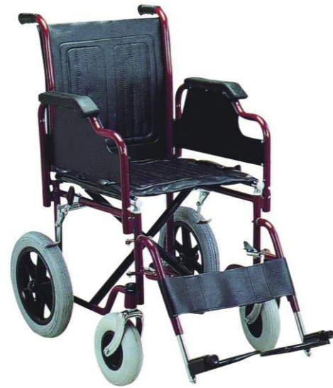
➤ BT974: Steel Wheelchair