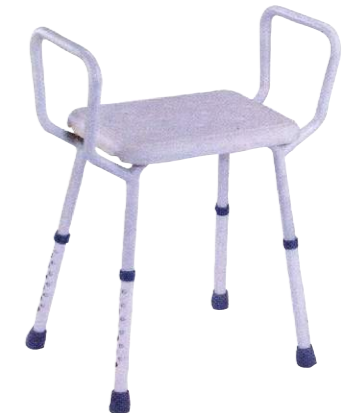
➤ BT412: Aluminum shower chair