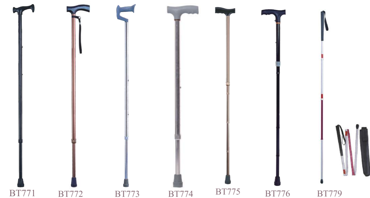
BT771 BT772 BT773 BT774 BT775 BT776 BT779