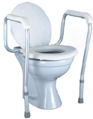
➤ BT436: Aluminum Toilet seat Safety frame