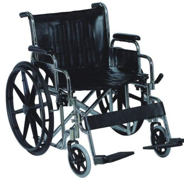
BT963: Heavy duty wheelchair