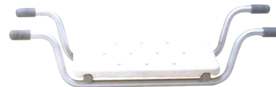
➤ BT424: Aluminum bath seat