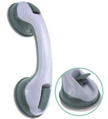
➤ BT442: Bathroom Suction Grip Bar