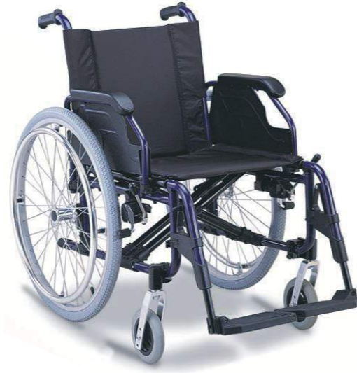
➤ BT902: Aluminum wheelchair