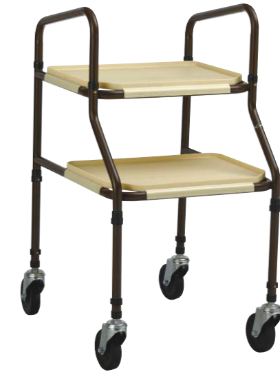
▶ BT528: Trolley walker