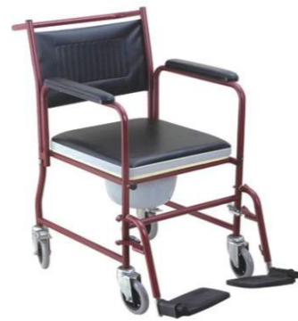
BT1017: Steel commode chair