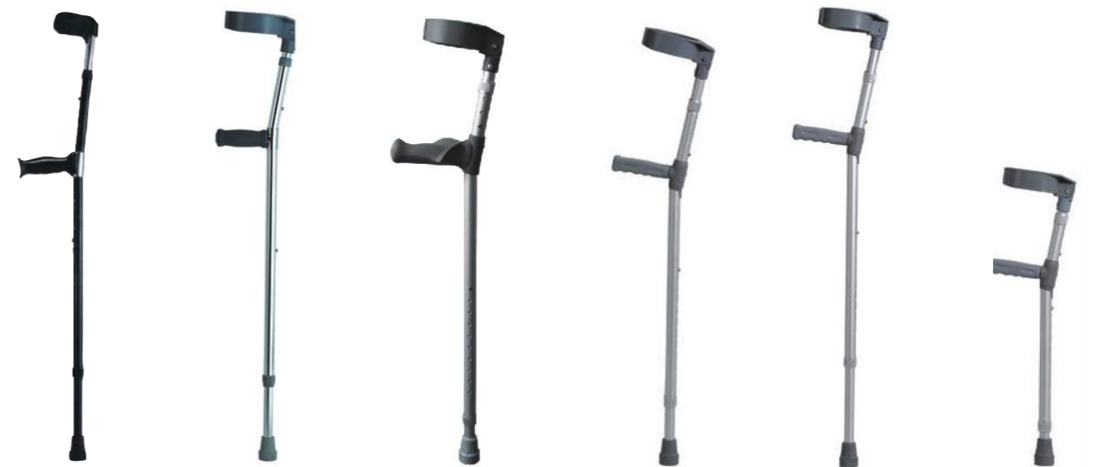
BT757 BT758 BT759 BT760 BT761 BT762