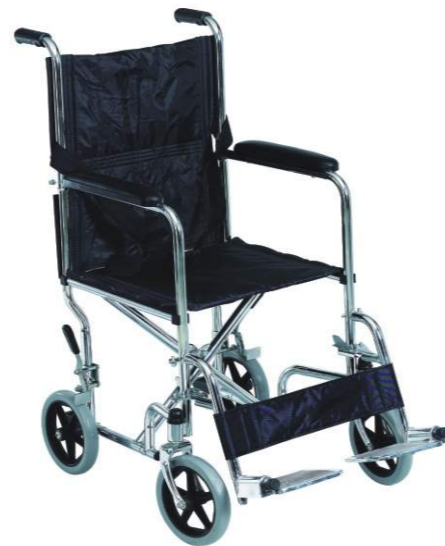
➤ BT975: Transport wheelchair