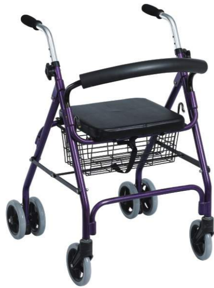
➤ BT818: Aluminum rollator