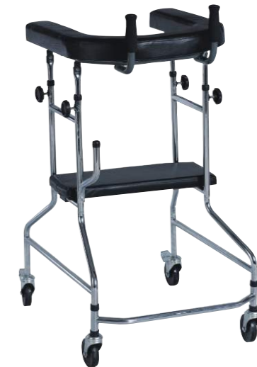
▶ BT581: Steel walker Foldable