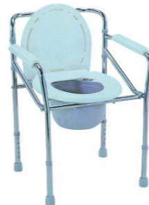
BT1050: Steel commode chair