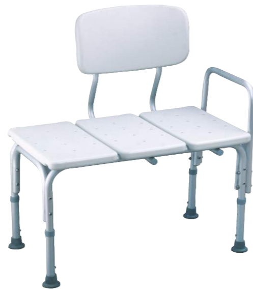
➤ BT406: Aluminum shower bench