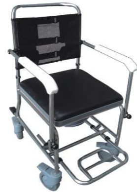
BT1018: Stainless steel commode chair