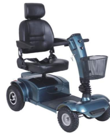
➤ BT8301: Electric Wheelchair