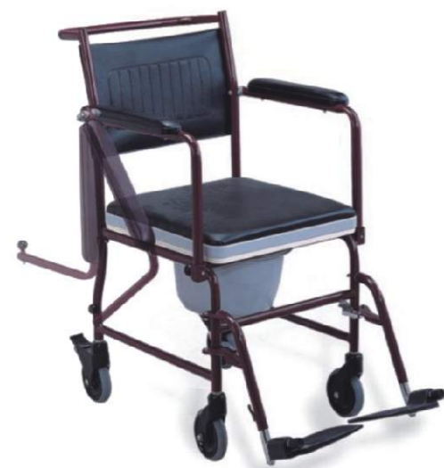
➤ BT1006: Steel commode chair