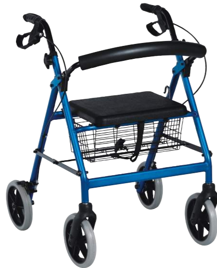
➤ BT820: Aluminum rollator