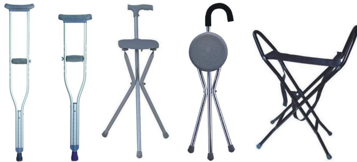
BT711 BT712 BT739 BT740 BT741