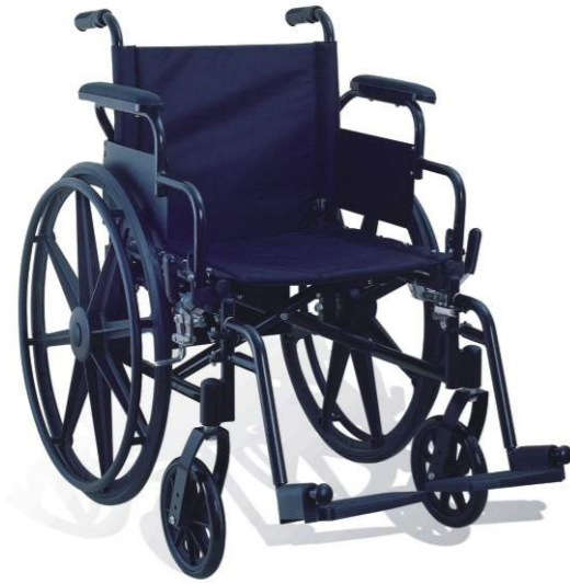
➤ BT901: Aluminum wheelchair